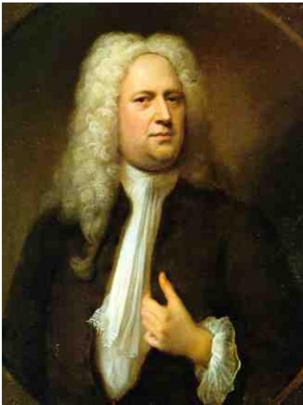
George Frideric Handel 1685 - 1759